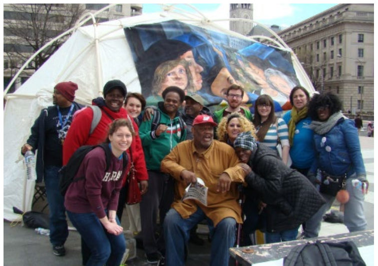
NCH staff, members, and activists