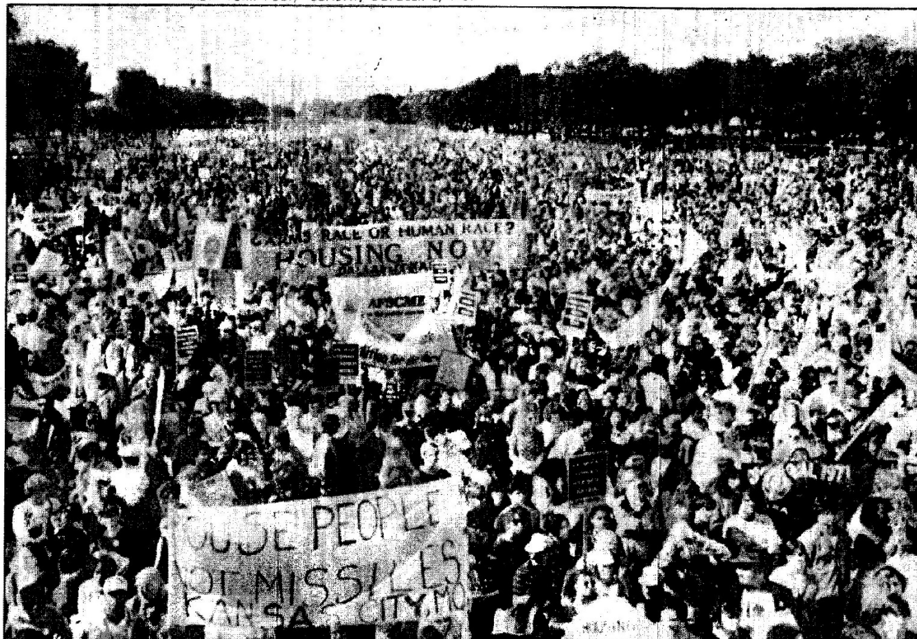
ON THE HOME FRONT: Thousands of housing advocates protest yesterday in Washington to urge an end to homelessness.