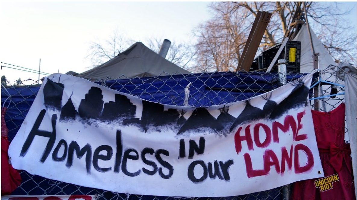
Camp Nenookaasi, a Beacon of Hope to the Unhoused, Faces Eviction. Unicorn Riot, Minneapolis, MN. December 14, 2023

Whose Streets? Our Streets! Whose Streets? [insert name of someone] [Joy's] Streets! [Insert name to honor someone]