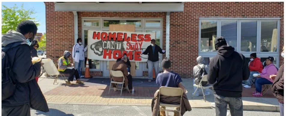
Housing Our Neighbors Baltimore, Maryland